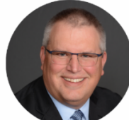
David Russell Fire & Safety Services, Inc.