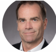
Crosby Grindle Sourcewell Executive Committee