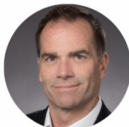
Crosby Grindle Sourcewell Executive Committee