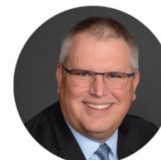
David Russell Fire & Safety, Inc.